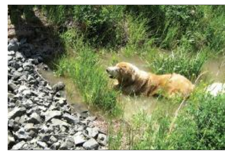
Woodrow, one of the owner's dogs, measures the depth of water in the swale during the demonstration