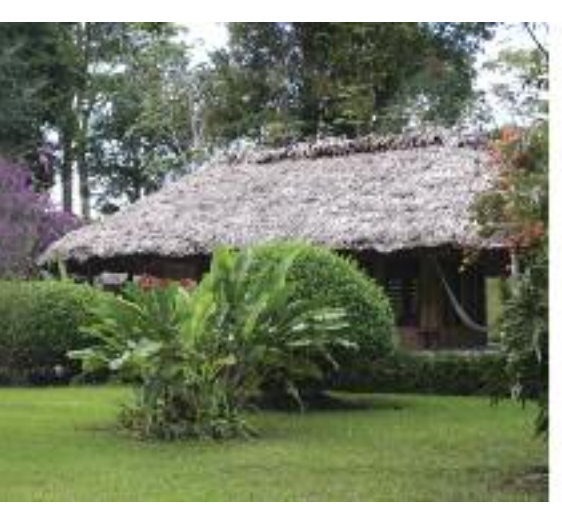
Guests stayed in cabanas.

Note: Plans are being made for next year's trip to Belize. Please watch for dates and details in the coming issues of the CNR newsmagazine.