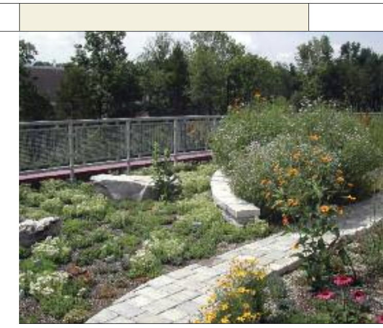
On both ends of WSSI's rooftop gardens are picnic and sitting areas for employees to enjoy.

Virginia Polytechnic Institute and State University