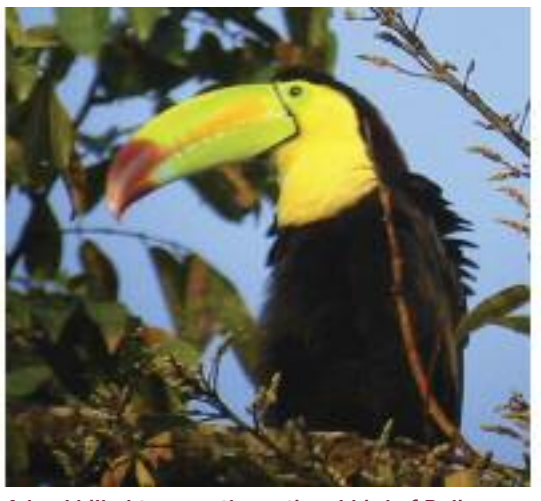
A keel-billed toucan, the national bird of Belize.