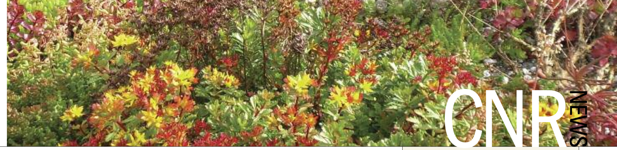
WSSI's rooftop bursts into bloom in the spring.

Wetlands Company Advances CNR's Capital Region Program AND Green Entrepreneurship